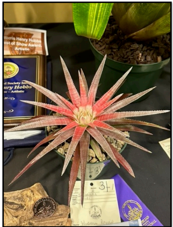
Sincoraea ulei on the head table at the 2024 World Bromeliad Conference in West Palm Beach, Florida.

Last month, we had a high quality selection of plants for our raffle table. The good news is that this month we will have another plant table from the same superior grower. The plants were all grown outdoors in Mission Viejo and are acclimated to our area. Once again, there should be a wide variety of genera and many unusual plants. We should also have another interesting silent auction.