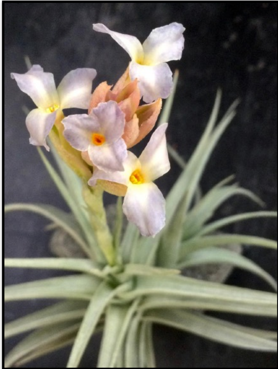
Tillandsia 'Inca Gold'.