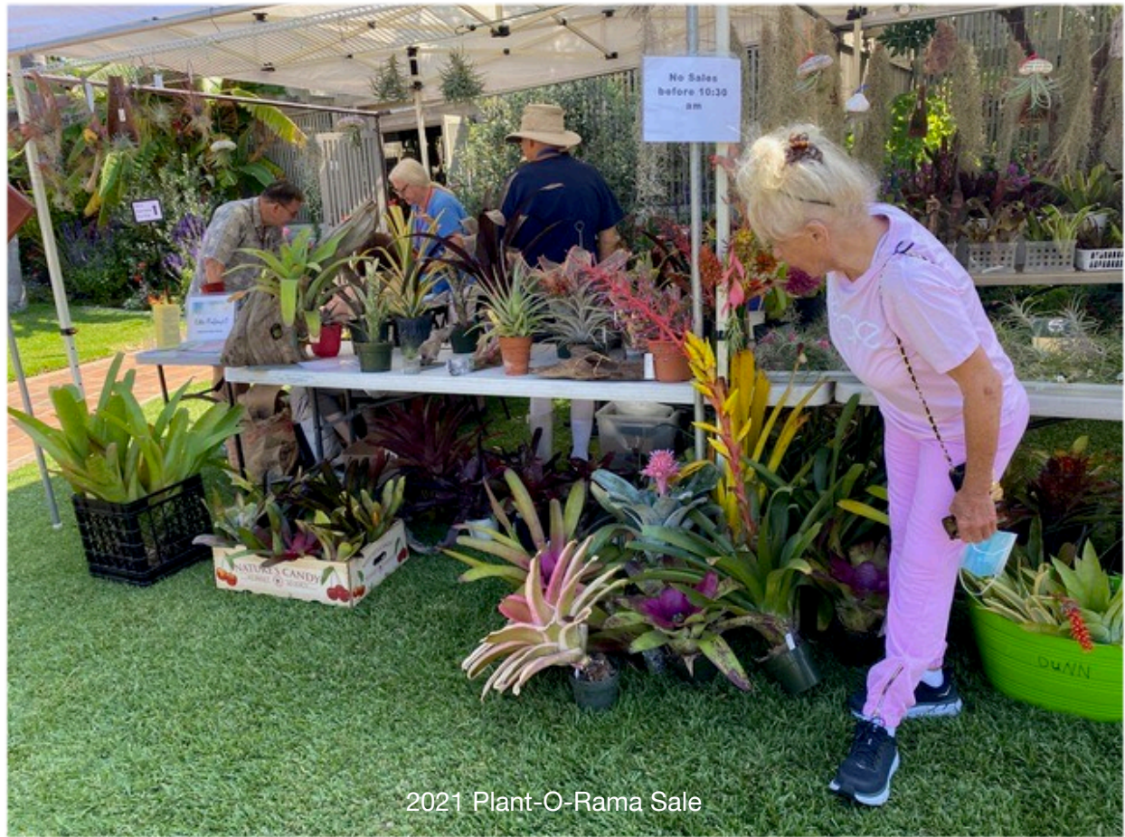
2021 Plant-O-Rama Sale